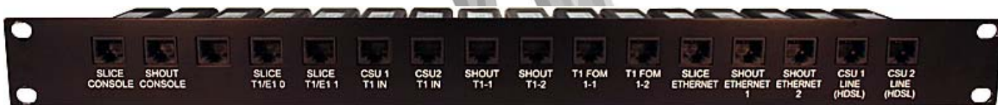
Custom screen printing available upon request

Application: The RackShield-2 protects assorted communication interfaces from transients caused by direct or indirect lightning strikes and other electrical surges. The RackShield-2 is a mix and match, modular, 1U high, 19" rack mounting surge protector with a flush face. Protection can be provided for up to 16 ports, with blanking plates available to cover any unused positions. Any mix of modules can be installed easily. Protection modules can be changed out or upgraded within seconds.