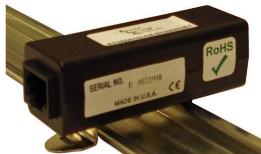
AT25001D shown mounted on 35 mm DIN rail

Surge suppression technology for your rack mounted lines and connected devices.